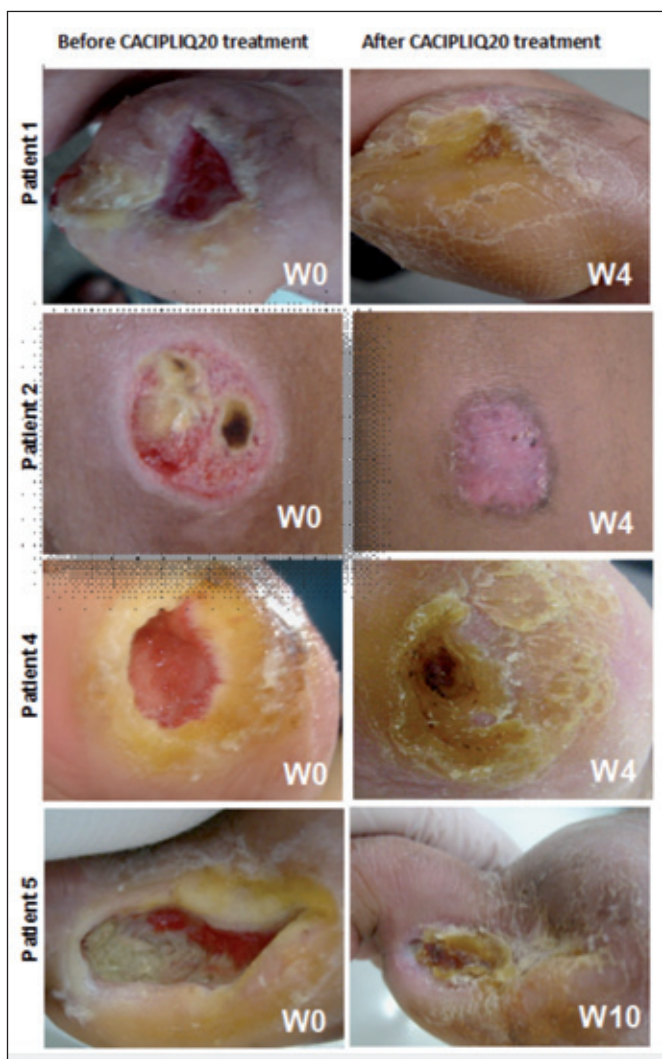
Figure 3: Wounds before and after CACIPLIQ20® treatment from patient 1, 2, 4 and 5

After the 10-week study, the patients received no further CACIPLIQ20® therapy leaving the 4 patients with persistent wounds at 10 weeks to standard care. After 6 months, in patient 7 the wound was fully healed. In the other 3 patients, no change in wound healing was noted compared to study completion. Moreover, no recurrence was observed after 6 and 9 months in the 6 patients with completely healed wounds. This in spite of their return to normal activity with well-tolerated weight bearing.